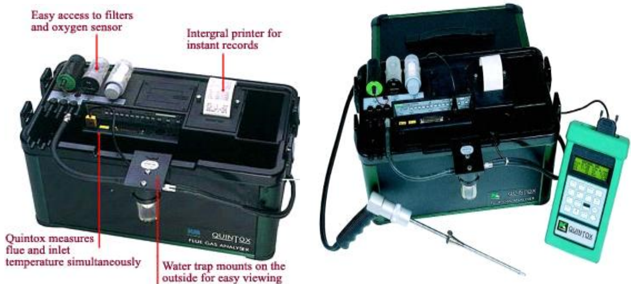
Fig 1: Instruments used to measure CO