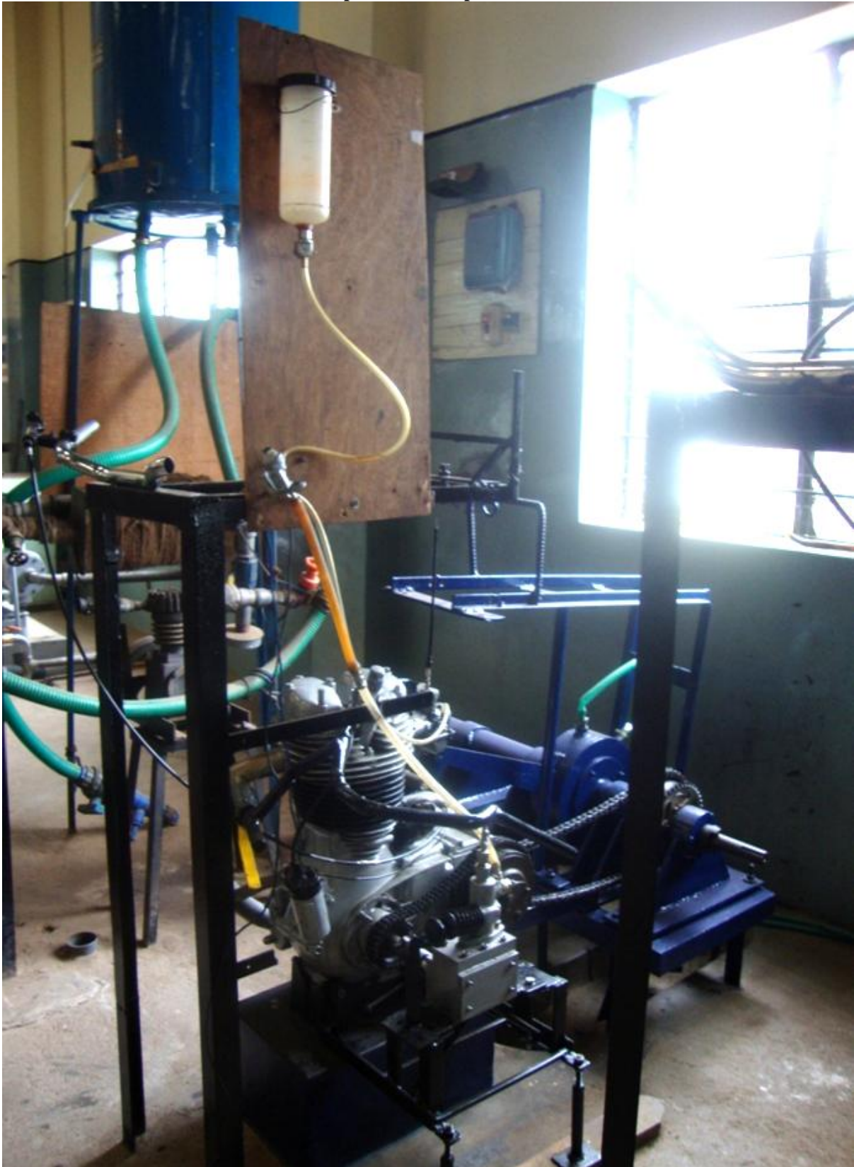
The photo shows Experiment conducted in a laboratory